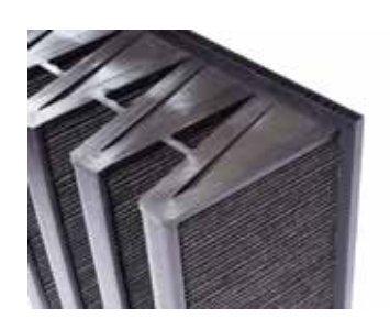
Engineered Design Maximizes Air-Flow and Filter Strength with Reduced Weight