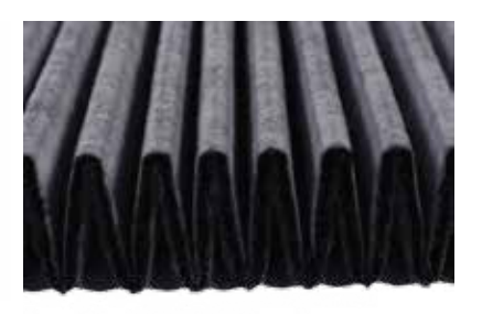
Precision Pleating for Optimum Surface Area and Increased Dwell Time